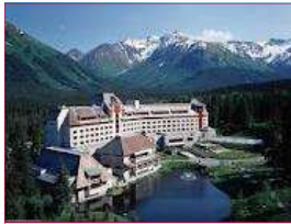
Women LISTEN retreats Renew the spirit and Refresh the body

Returning guests will be accommodated if space permits. Included are all activities and materials, lodging and meals (breakfast, lunch and dinner on Saturday & breakfast on Sunday). Snacks, tea and coffee are also provided. Each participant is offered a therapeutic massage from a trained Oncology Massage Therapist. The retreat facility has a swimming pool, whirlpool, sauna, exercise room and quiet areas with spectacular views for your enjoyment.