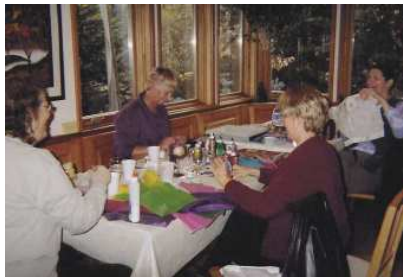
Enjoying crafts at a Women LISTEN retreat.

~ We became a 501(c)3 non-profit organization in September 2004.